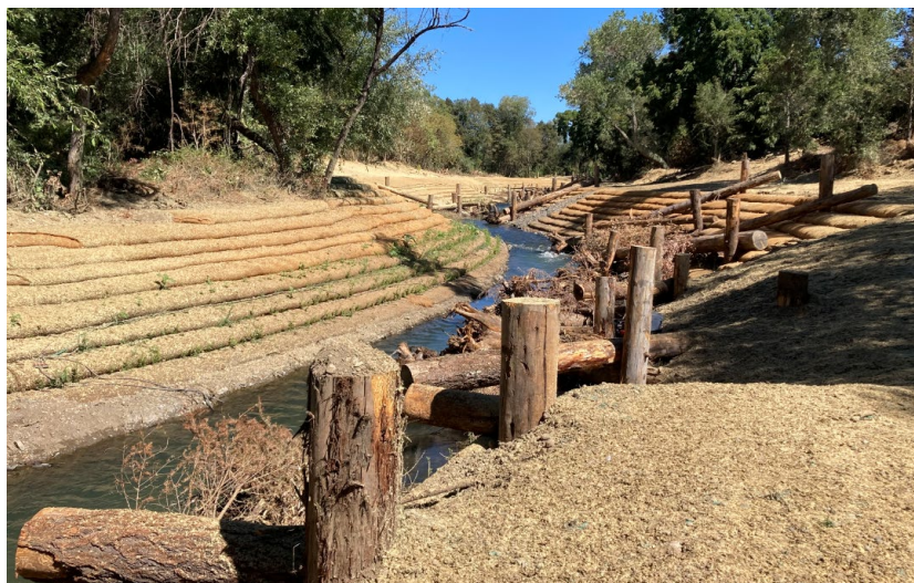
Site 10A1 Side Channel looking upstream.

Phase VI is in final stages of design and planning, with construction tentatively planned for 2026.