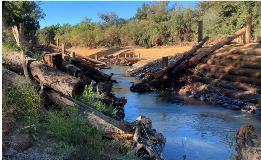
Site 10A1 Side Channel looking downstream from the inlet.

ROD Construction has completed the remaining 4 sites in Reach 2, and the post-construction walkthrough inspection occurred on September 4, 2024. This completes the construction of Phase V of the Dry Creek Habitat Projects